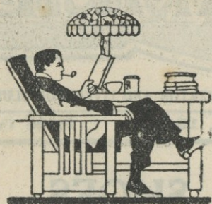
The Battle Eve "Duets."

To-day everybody that is anybody in the Cup is "living in hopes." Eight clubs, eighty-eight players, every official and director concerned, and half a million thick and thin supporters are at the moment packed full with hope. In fact to-day may be called the Cup's Cape of Good Hope stage, wherein those directly interested can sort of spy the goldfields just around the corner. But, more important still is the honour of it all. Eight potential Cup winners and all eager to go over the top, to do or die. For victory to-day means entry into the select circle, to be handed down to posterity as the 1933 Cup semi-finalists.