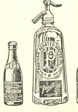
"Enjoy-A Good Thirst."

SPARKLING PENDLE WATERS and CHOICEST MATERIALS.