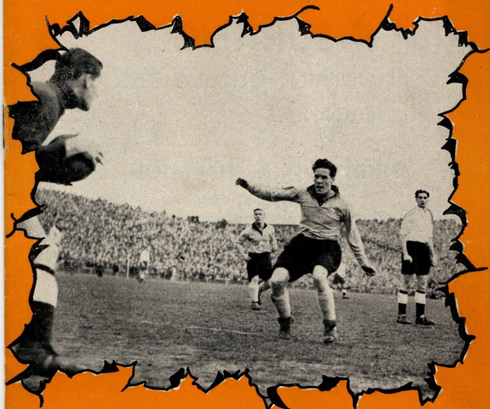
An incident during the Hull City v. Tottenham Hotspur match on Monday, 10th April, 1950