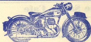
724A 500 c.c. S.V. Model M20

MILLETT STREET SHOWROOMS and GARAGE BURY