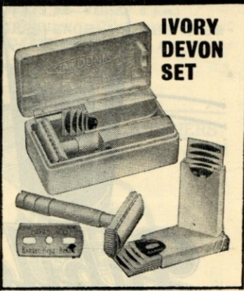
IVORY DEVON SET

Sole Makers THOMAS WARD & SONS LTD WARDONIA WORKS SHEFFIELD