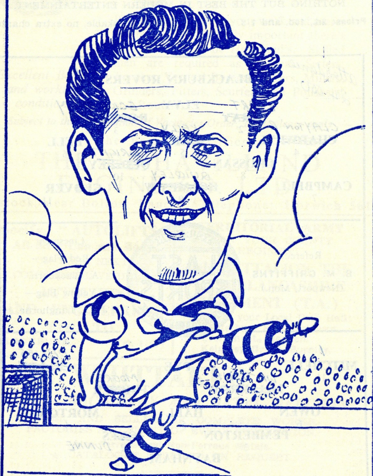
'SPIKE' B'BURN TIMES CARTOONIST.