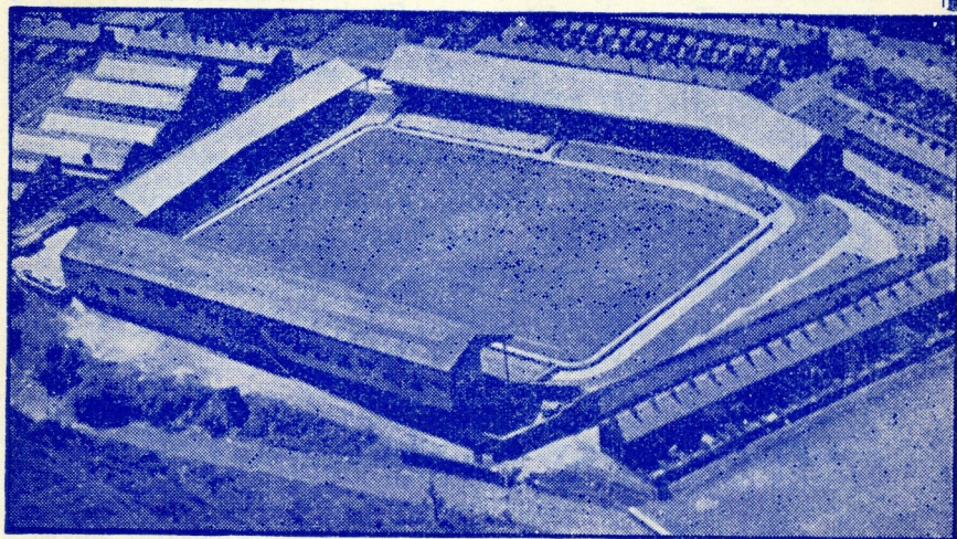
Aerial View.—Ewood Park.