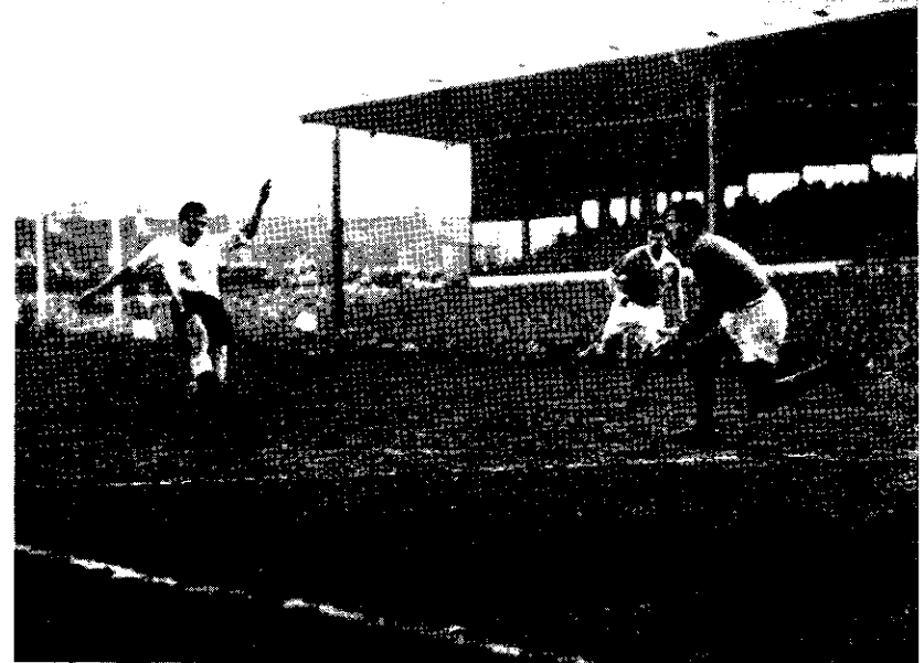
LUTON TOWN v. BLACKPOOL