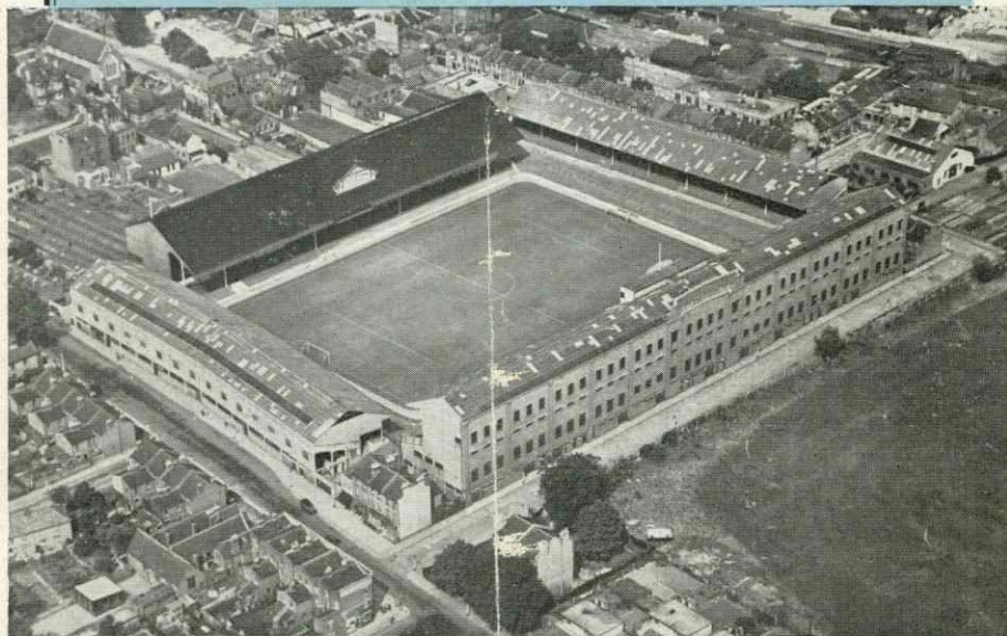
AERIAL VIEW OF THE SPURS GROUND

FOOTBALL ASSOCIATION CHALLENGE CUP SEMI-FINAL TIE