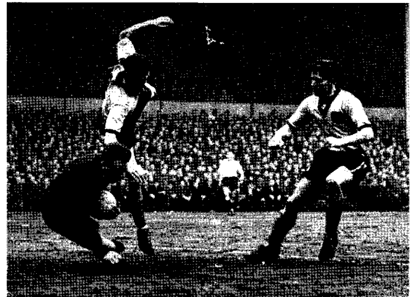
TOTTENHAM HOTSPUR v. NORWICH CITY