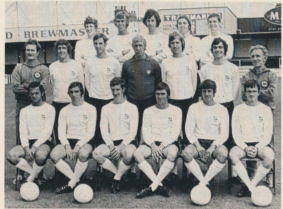
LUTON TOWN FOOTBALL CLUB SEASON 1971-72

Their away record is surprisingly good for a club in 14th position. Luton have conceded 23 goals in away matches but only three clubs can better that, Birmingham with 16, Norwich with 18 and Queen's Park Rangers with 19. Between them, those clubs hold three of the top four positions so Luton can plan for next season on a solid defence.