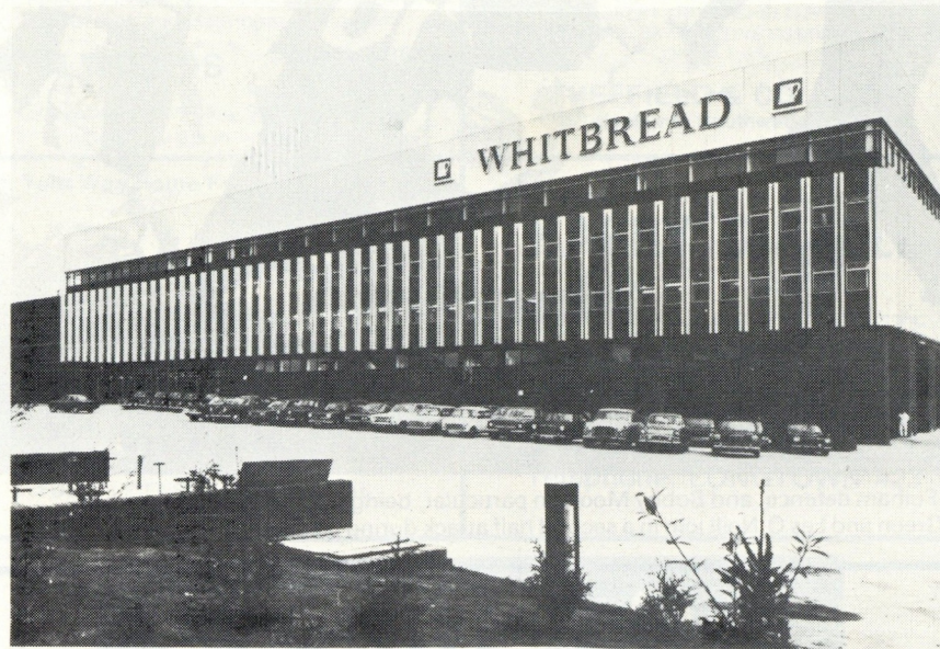
Whitbreads Brewery, Luton