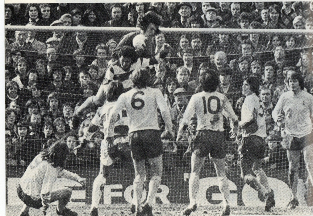
Pat Jennings shows his superb form in this action as he jumps well above Rangers' forward Don Givens.