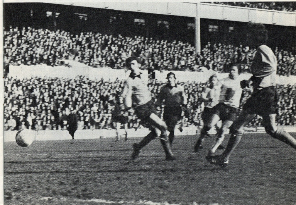
Steve Perryman squeezes his shot between the Wolves defenders to score the first of his two goals.