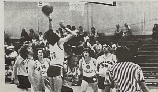
Basketball action at Washington.

Epab, who wear red-and-white stripes, did not let them down. They lost 122 - 100, but Embassy are regarded as the country's current best and rarely do they concede 100 points.