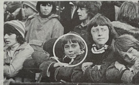
This weeks Lucky Face is from the Sunderland v Millwall match on Saturday 15th October, 1977