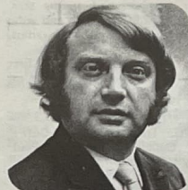
By DOUG WEATHERALL (Daily Mail)