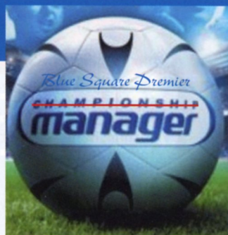
Steve's line-up for today