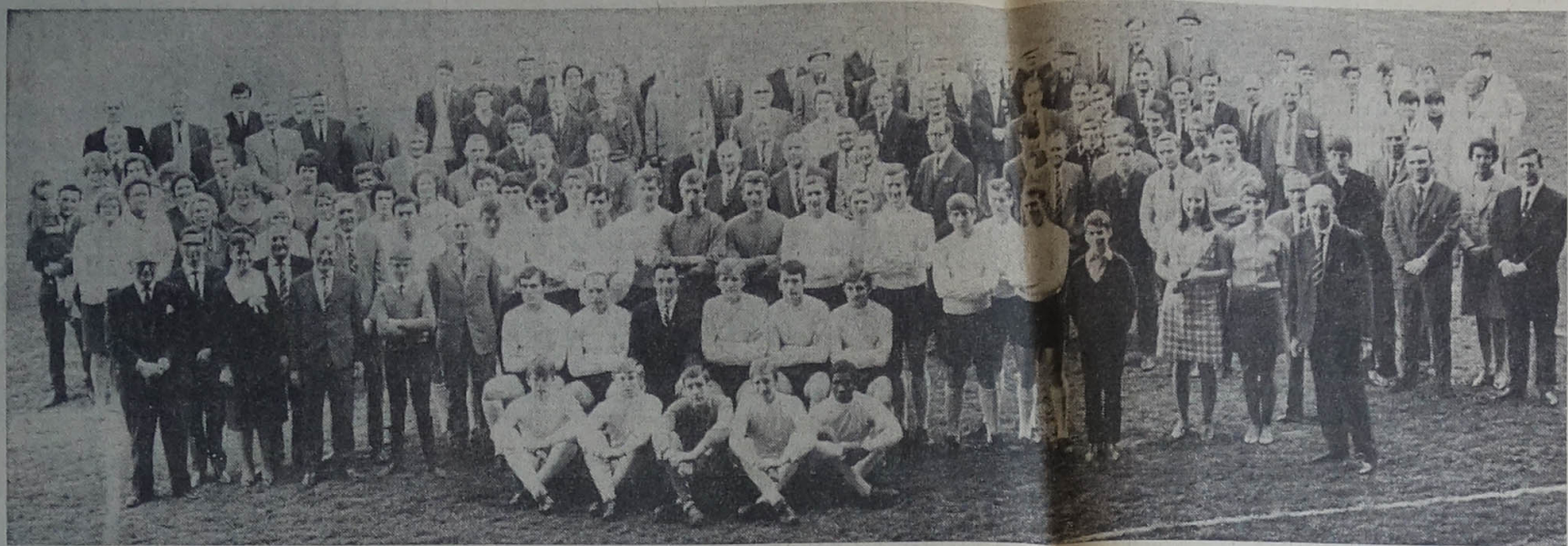
Historic picture taken before the home match with Crewe Alexandra of the playing staff, together with directors and officials and all those who have had a part in the smooth running of the club during the season.—GG7135K.