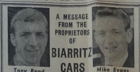
A MESSAGE FROM THE PROPRIETORS OF BIARRITZ CARS

That in itself is a tribute to the measure of the success he has achieved in rather less than 18 months.