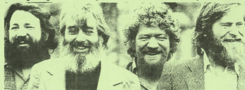
● THE DUBLINERS: asked to come back to Luton.

New signings? Surely we're not that desperate.