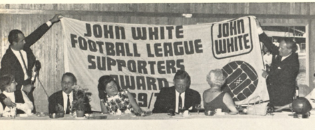
1. To our supporters for winning the 'John White Award'.